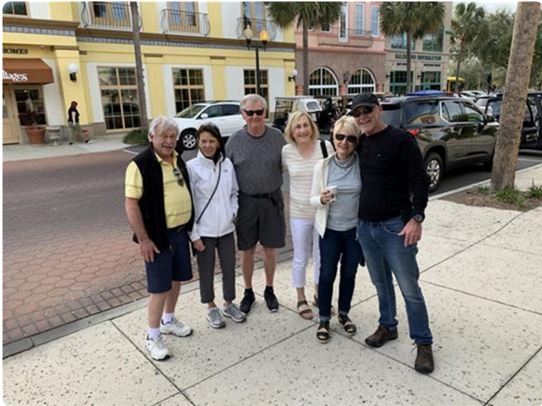
visit to the villages and a great time